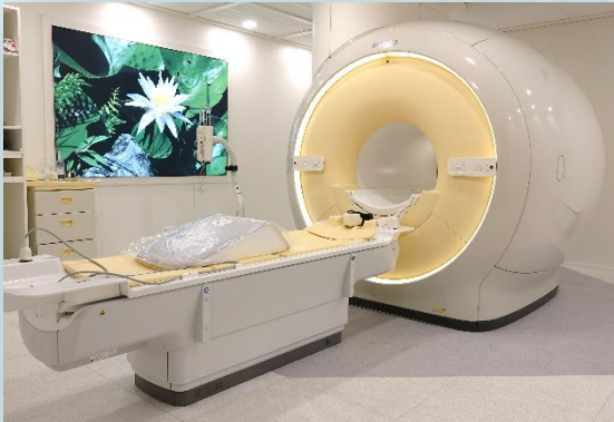
Multislice CT Scanners