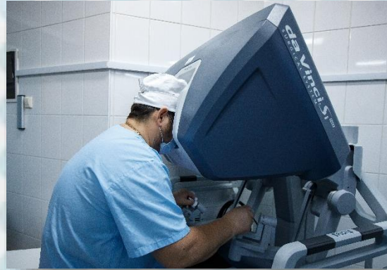
Da Vinci Surgical Systems