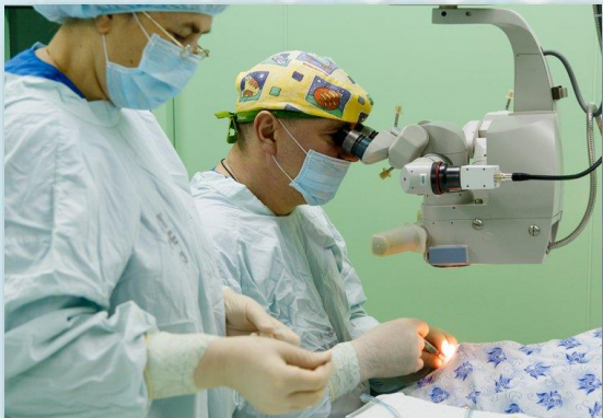
Phacoemulsification and Vitrectomy Systems

More than 25,000 units of modern medical equipment