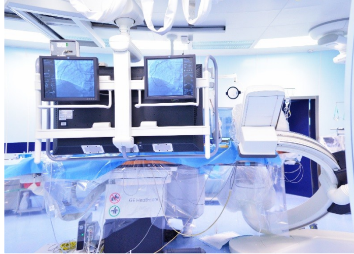
Endovascular Surgery Unit – 4